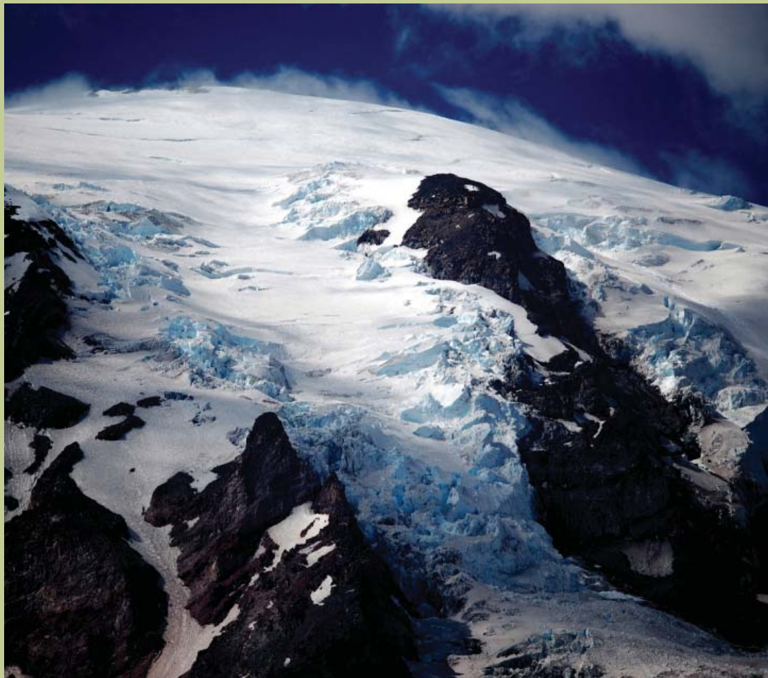
▲ DESIGNER'S CHOICE Mount Rainier in the sunshine and wind. Mount Rainier National Park. Philip Westfall