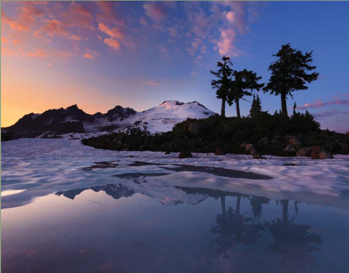
▲ FIRST PRIZE • WILDERNESS LANDSCAPES Crystalline Kulshan, a new take on a classic beauty. Park Butte Trail, Mount Baker Wilderness.