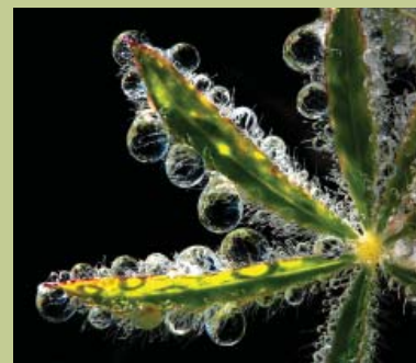
▲ GRAND PRIZE • NORTHWEST EXPOSURE 2009 Lupine covered with morning dew. Green Mountain Trail, Mount Baker-Snoqualmie National Forest. Misao Okada

Layout and design by Ann Rhodes of Rhodes-D-Signs Photography tips by Wade Trenbeath.