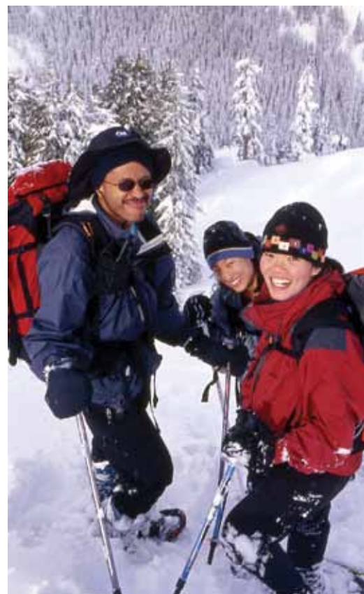
Snowshoers exploring Guye Peak.