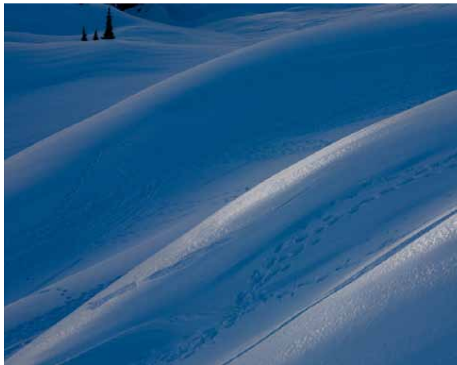
Capturing patterns in the snow, Kulshan Ridge in winter.

“ We are salmon, swimming upstream against the current of Gore-Tex, fleece and iPods. ”