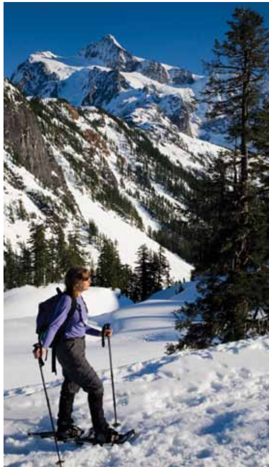
Pausing on the ascent to Artist Point to enjoy the winter spectacle.

Dinner eaten, we relax on our snow loungers, exchanging stories and watching the stars. In our numerous layers of polypro, fleece and Gore-Tex, we're warm and comfortable. Life is very good indeed here on Kulshan Ridge. ♦