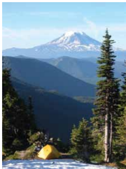
This hiker found a durable surface to set-up on in the Goat Rocks Wilderness.